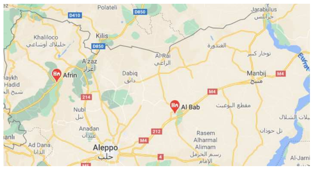
Figure 2: Northern Aleppo Governorate<sup>19</sup>

In October, there were reports of clashes between non-state armed groups as well as targeted attacks on civilians and humanitarian workers in northwestern Syria in areas such as Afrin, A'zaz and Jarablus, Aleppo.<sup>17</sup> Many security incidents in Aleppo in 2020 occurred in the so-called 'conflict hotspots'<sup>18</sup> Afrin and al-Bab in northern Aleppo Governorate, as illustrated later on.